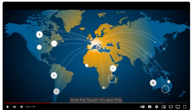
Why invest in Provence-Alpes-Côte d’Azur?

Discover the new film: Why invest in the South of France?